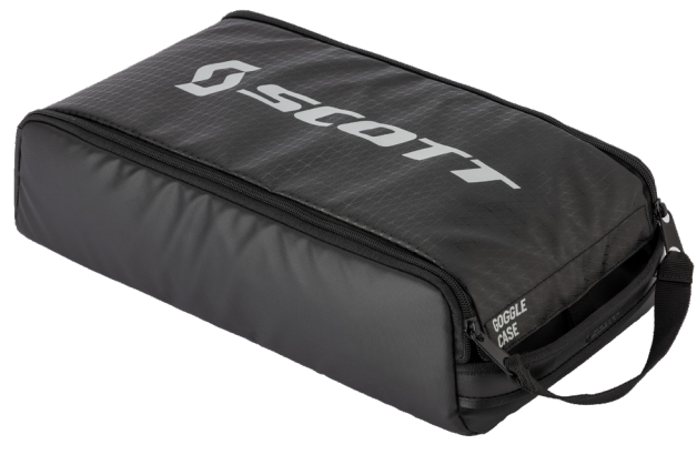
black/dark grey 1659