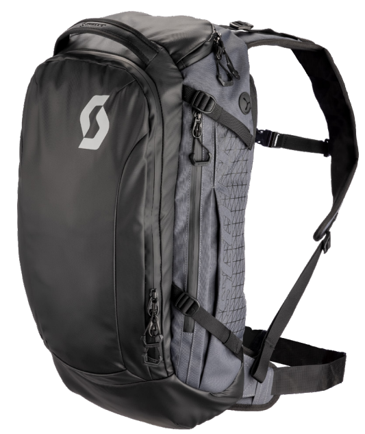
black/dark grey 1659