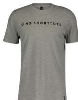
light grey melange