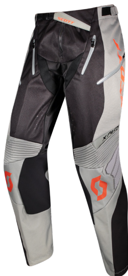
grey/black 1019 (Available up to 44)