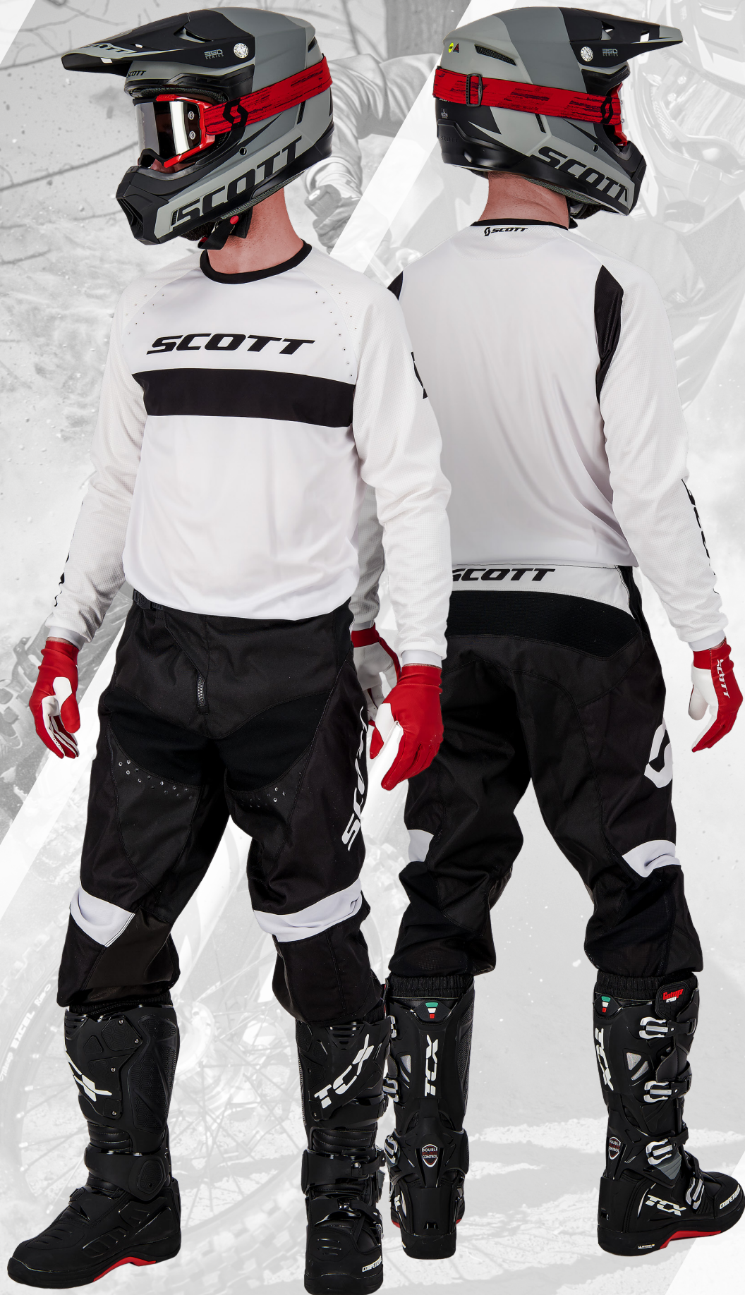
SCOTT 350 SWAP EVO