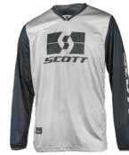
dark blue/grey 6511 (Available up to 3XL)