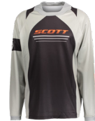
grey/black 1019 (Available up to 4XL)