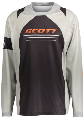
grey/black 1019 (Available up to 4XL)