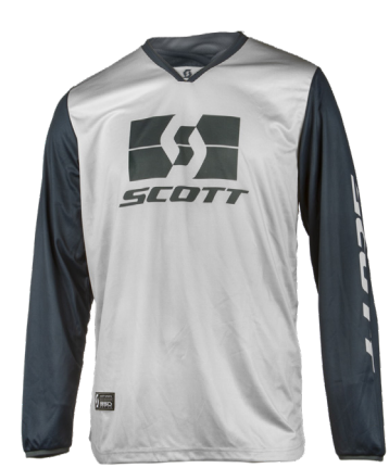
dark blue/grey 6511 (Available up to 3XL)