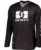
black 0001 (Available up to 3XL)