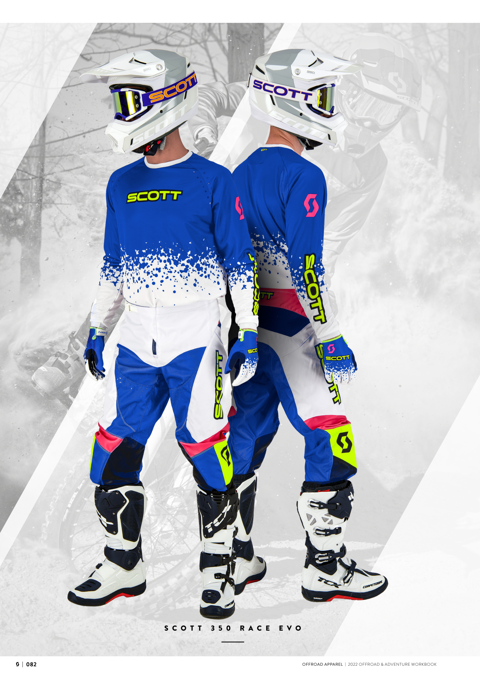
SCOTT 350 RACE EVO