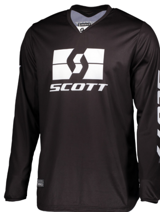
black 0001 (Available up to 3XL)