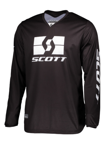
black 0001 (Available up to 3XL)