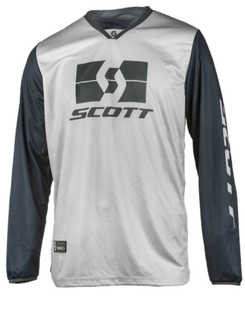
dark blue/grey 6511 (Available up to 3XL)