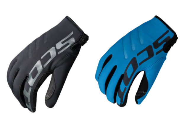
lake blue/night blue 6374