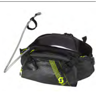
black/neon yellow - 4755