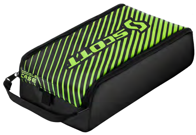
black/neon yellow - 4755