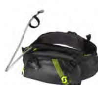
black/neon yellow - 4755