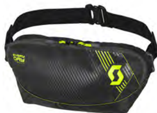
black/neon yellow - 4755