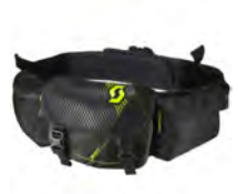
black/neon yellow - 4755