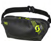
black/neon yellow - 4755