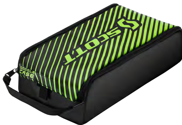
black/neon yellow - 4755