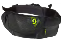
black/neon yellow - 4755