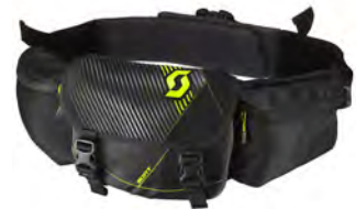
black/neon yellow - 4755