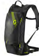
black/neon yellow - 4755