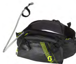
black/neon yellow - 4755