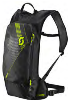
black/neon yellow - 4755