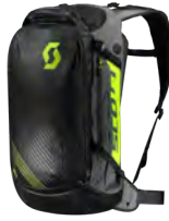
black/neon yellow - 4755