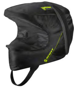
black/neon yellow - 4755