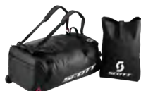
black/red clay - 5446