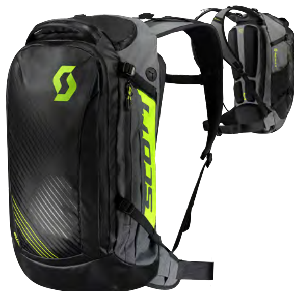
black/neon yellow - 4755