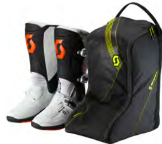
black/neon yellow - 4755