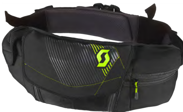
black/neon yellow - 4755