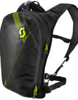
black/neon yellow - 4755