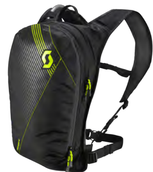
black/neon yellow - 4755