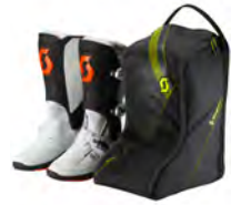
black/neon yellow - 4755