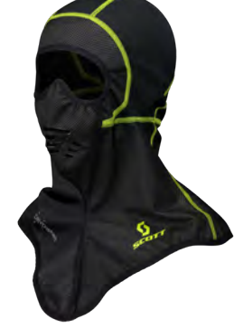
black - 0001