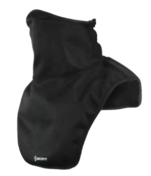
black - 0001