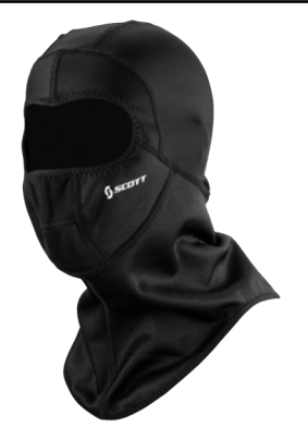
black - 0001