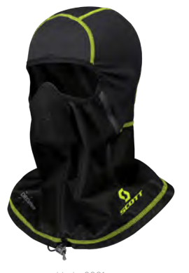
black - 0001

CONSTRUCTION: 60% Polyester, 35% % other fibers