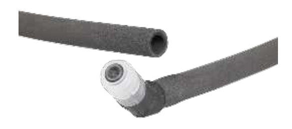
SCOTT TPU foam tube with surge valve