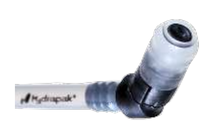
SCOTT Surge Valve