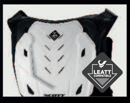
PERFECT LEATT® INTEGRATION