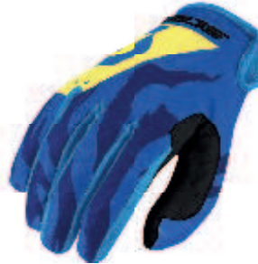
blue/yellow - 1054