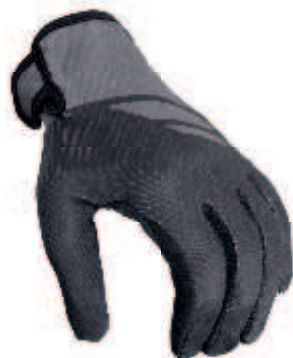
black - 0001