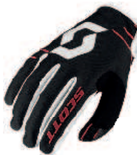
red/black - 1018