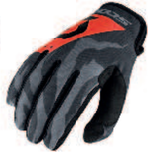
black/orange - 1009

CONSTRUCTION: TOP HAND: twill spandex, PALM: Clarino, Lycra trim COMPOSITION: PALM: 60% Nylon, 40% Polyurethane, UPPER: 22% Polyester, 15% Nylon, 8% Polyurethane SIZE: S-XXL