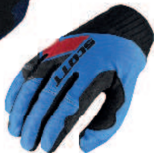
blue/red - 5411