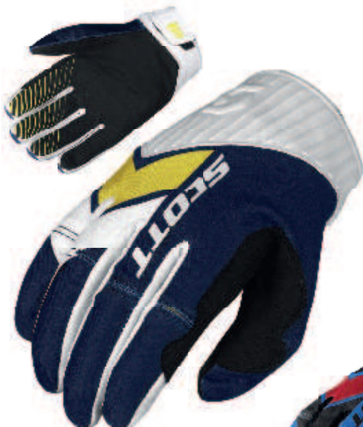
blue/yellow - 1054