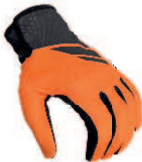
orange - 0036