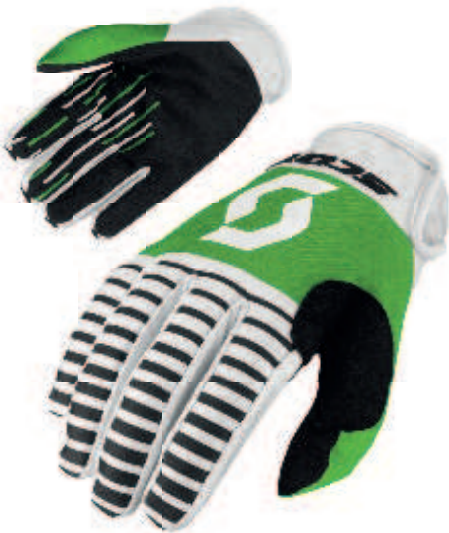
black/white - 1007

The SCOTT 350 glove was designed with a minimalist approach. The single layer palm offers an unprecedented feel. With a simple slip on design, a spandex upper, a polyester palm and a no-slip neoprene cuff this glove offers the best bang for the buck around.