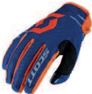
blue/orange - 1454