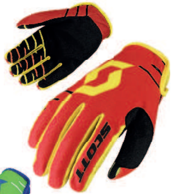
black/yellow - 1040