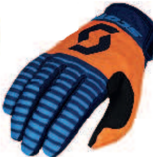
blue/orange - 1454

CONSTRUCTION: TOP HAND: twill spandex, PALM: Clarino, Lycra trim COMPOSITION: PALM: 60% Nylon, 40% Polyurethane, UPPER: 22% Polyester, 15% Nylon, 8% Polyurethane SIZE: S-XXL