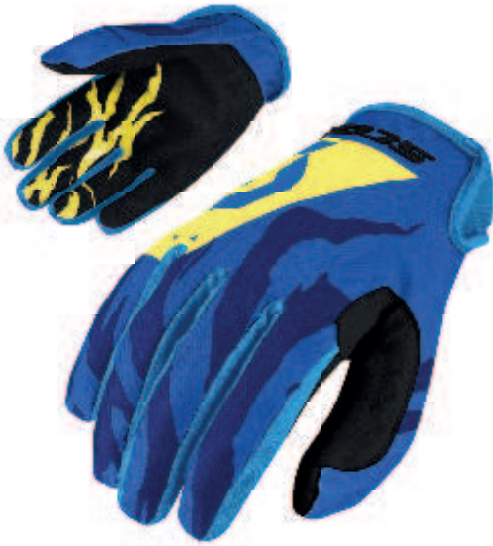
blue/yellow - 1054

The SCOTT 350 glove was designed with a minimalist approach. The single layer palm offers an unprecedented feel. With a simple slip on design, a spandex upper, a polyester palm and a no-slip neoprene cuff this glove offers the best bang for the buck around.