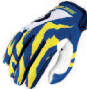
blue/white - 1006