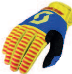
yellow/red - 4039