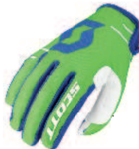
white/blue - 1029