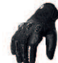
black - 0001

FEATURES: + Top grain premium leather palm patch for durability + Top grain premium leather + Carbon fiber knuckle reinforcement + Tacky finger grip