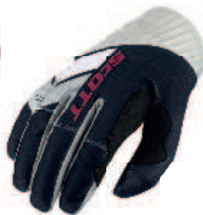
black/white - 1007