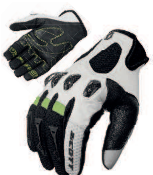
black/white - 1007

One of SCOTT's most technically advanced gloves. The SCOTT Assault Glove features a premium leather palm and carbon fiber knuckle pads. A second premium leather patch reinforces the knuckle area, and tacky finger grips round out the ultimate glove for the aggressive off-road rider.