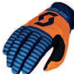
blue/orange - 1454