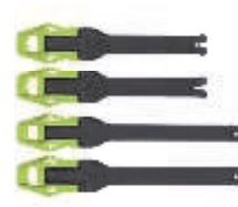
green/black - 1089

SCOTT Boot Straps are high-quality replacements in case you lose one in a crash.