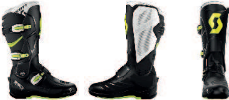
black/green - 1043