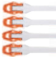
orange/white - 1362