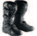
black/black - 1401