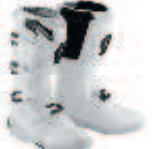
white/white - 2597