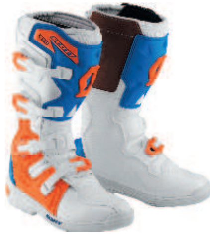
white/blue - 1029