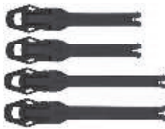
black/black - 1401