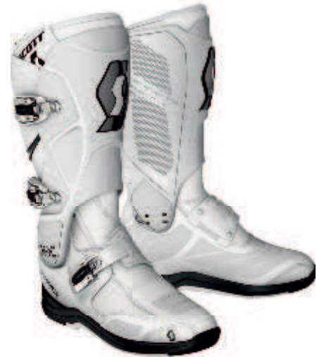
white/white - 2597