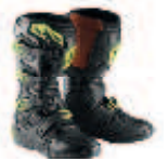
black/green - 1043