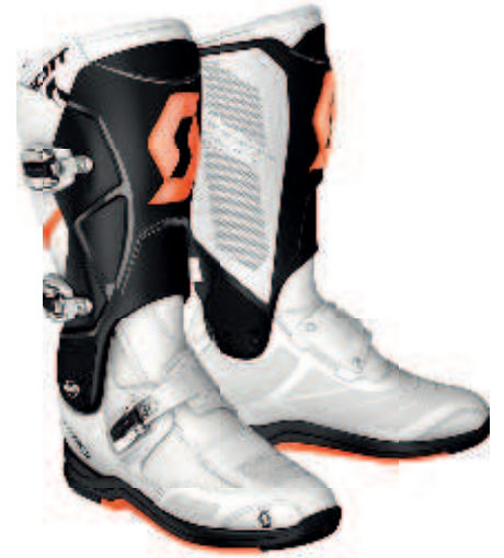
white orange - 1088