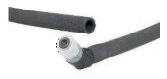
SCOTT TPU foam tube with surge valve