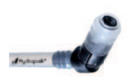
SCOTT Surge Valve