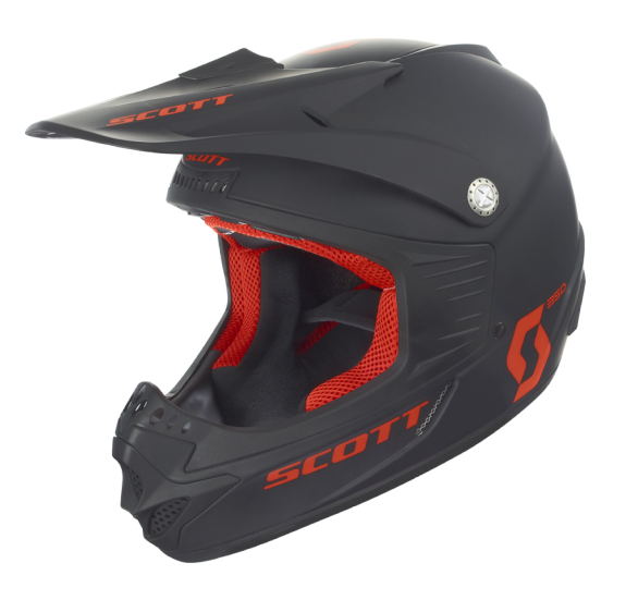
blue/orange - 1454