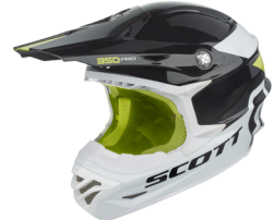
black/green - 1043