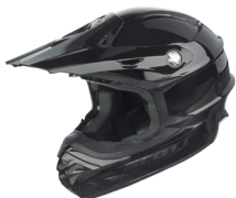
black - 0001