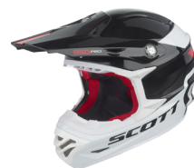
black/red - 1042