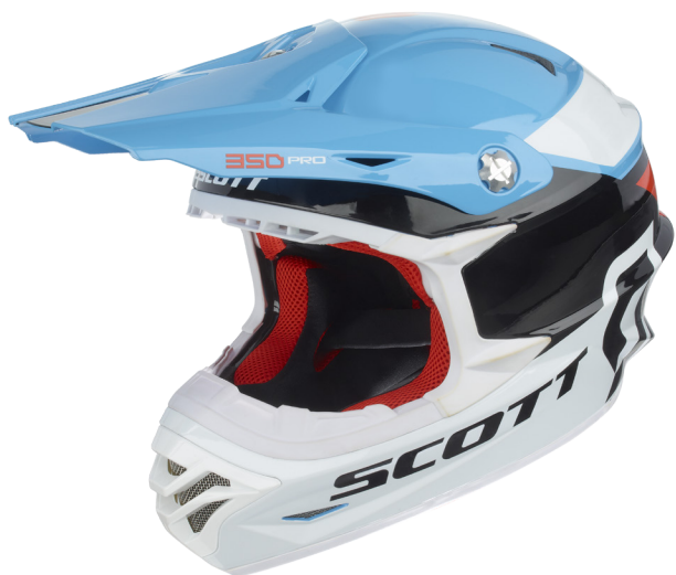
blue/orange - 1454