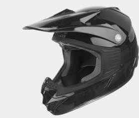
black - 0001