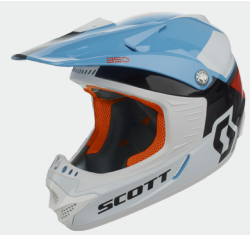
blue/orange - 1454