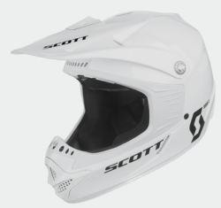
white - 0002