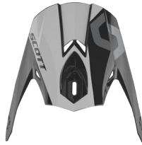
black/white - 1007