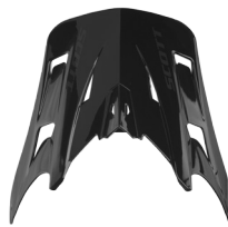
black - 0001