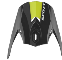
black/green - 1043