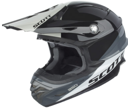
black/white - 1007