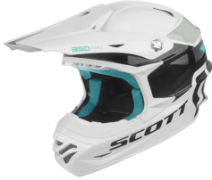
white - 0002