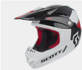
black/red - 1042