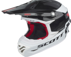
black/red - 1042