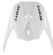
white - 0002