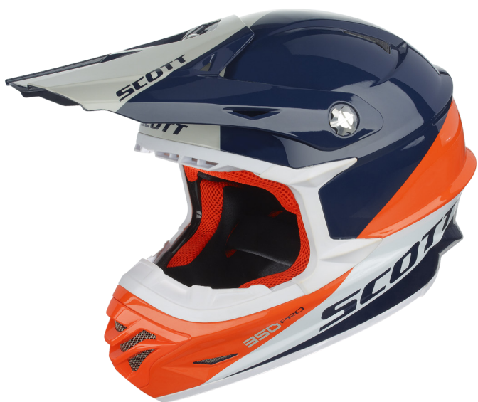
blue/orange - 1454

FEATURES + Removable, Washable, liner and cheek pads + Highly integrated intake and exhaust vents + Easy adjust visor