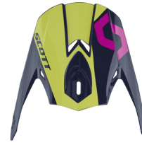
blue/pink - 2839