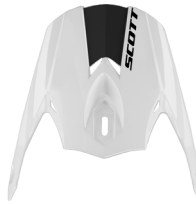
white - 0002