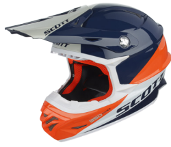
blue/orange - 1454