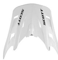
white - 0002