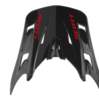
satin black/orange - 4972