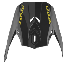
black/yellow - 1040