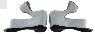
black/grey - 1001