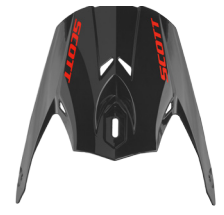
satin black/orange - 4972