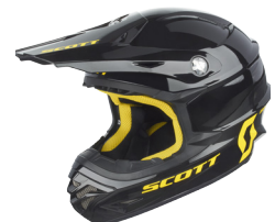
black/yellow - 1040