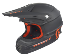
satin black/orange - 4972