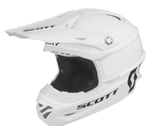
white - 0002