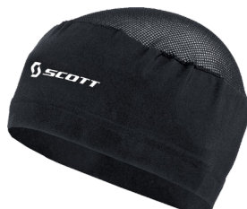
black - 0001