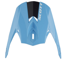
blue/orange - 1454