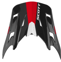
black/red - 1042