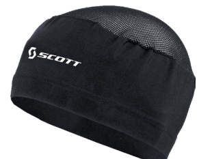
black - 0001