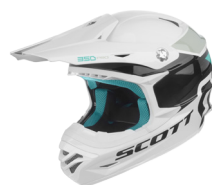
white - 0002