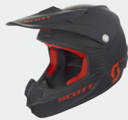
satin black/orange - 4972