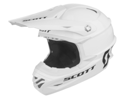
white - 0002