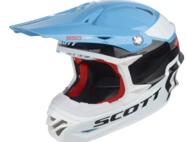
blue/orange - 1454