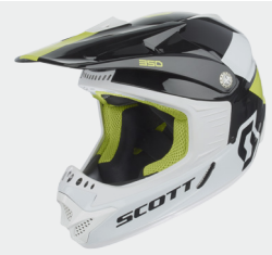
black/green - 1043