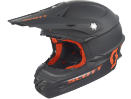
satin black/orange - 4972