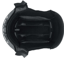
black - 0001