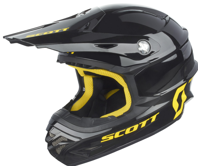
black/yellow - 1040