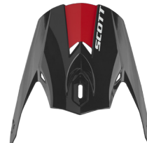
black/red - 1042