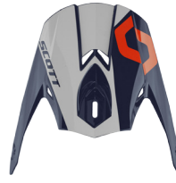
blue/orange - 1454