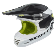
black/green - 1043