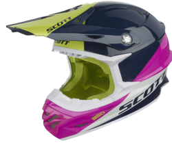
blue/pink - 2839