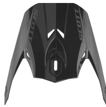
black - 0001