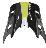
black/green - 1043