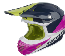
blue/pink - 2839