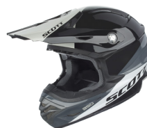
black/white - 1007