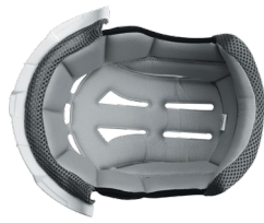
black/grey - 1001