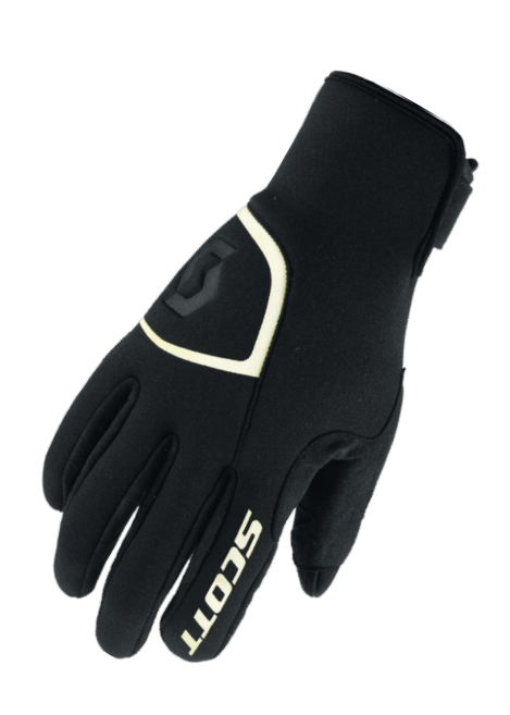
black/white - 1007