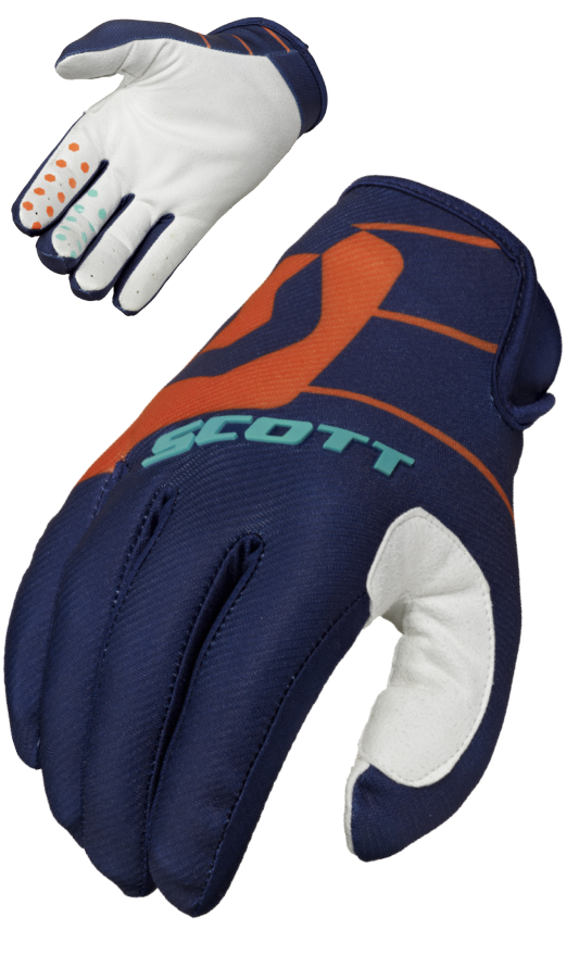
blue/orange - 1454