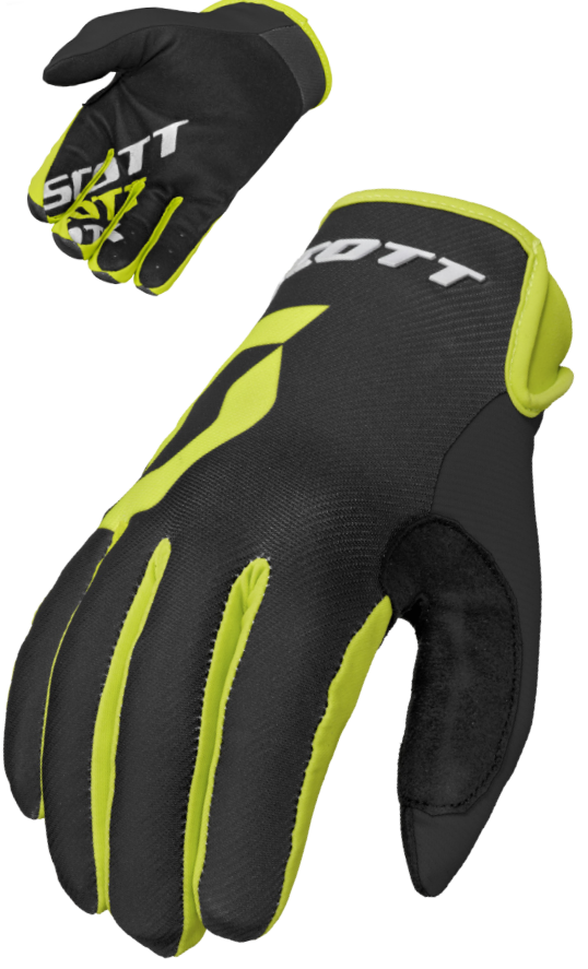
black/green - 1043