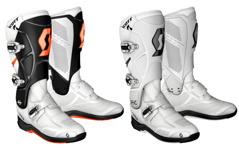
orange/blue - 1415