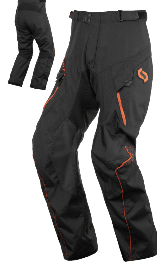
black/orange - 1009