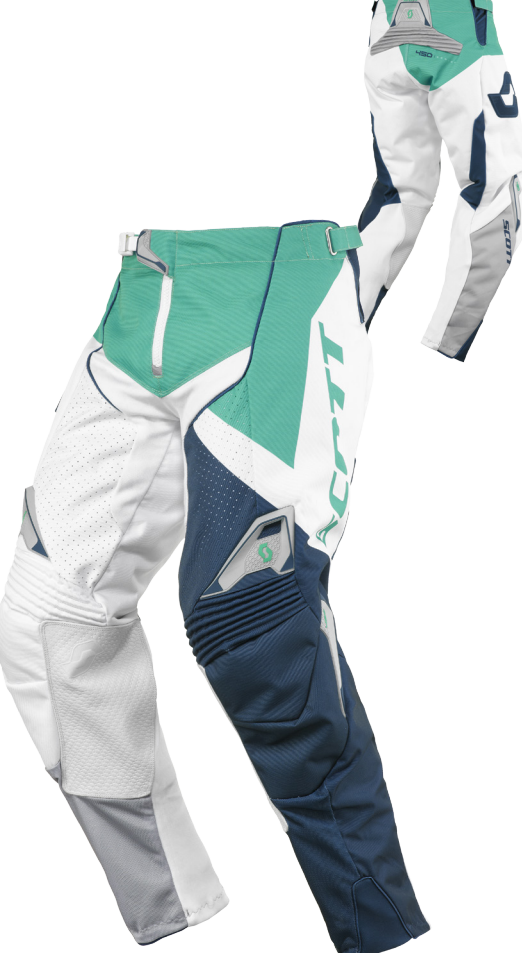
green/blue - 2278