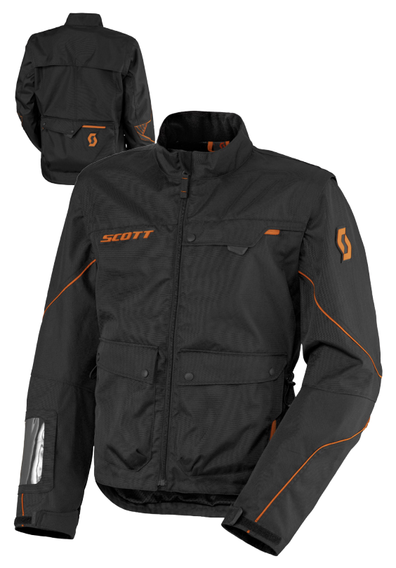
jacket is all you need to be prepared on the trails. CONSTRUCTION: 600D Polyester fabric with

weatherproof DWR finishing COMPOSITION: 100% Polyester, LINING: 100%