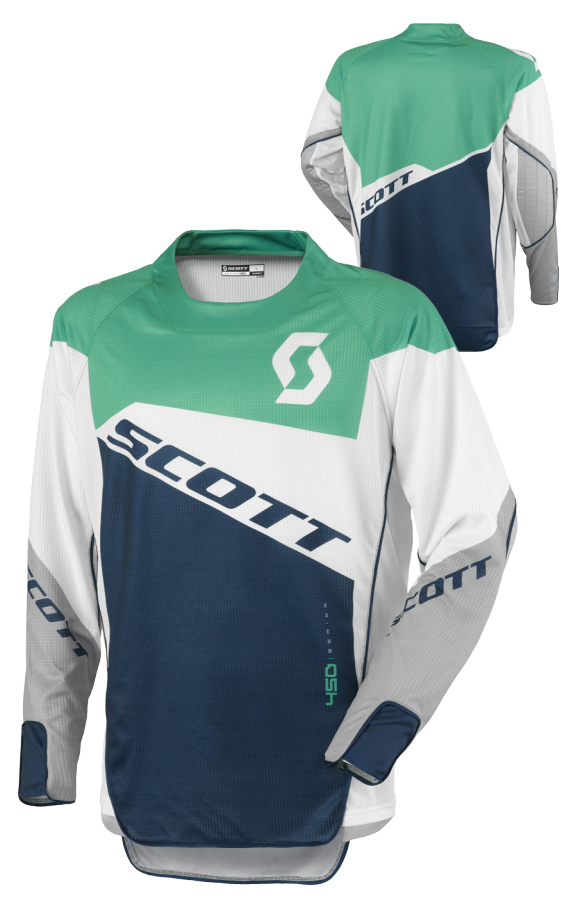
green/blue - 2278